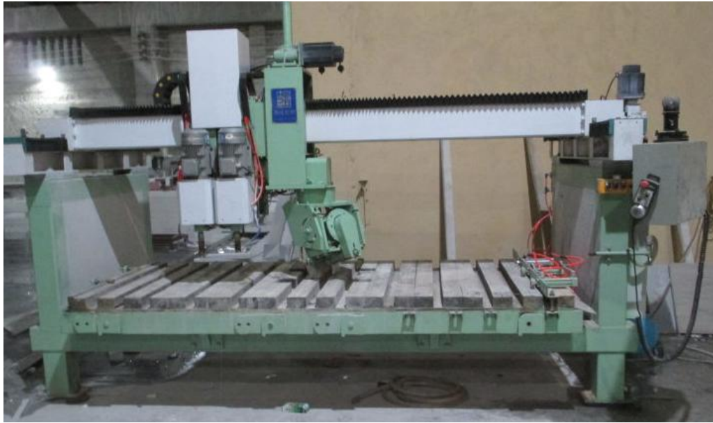
Auto Hole Digging