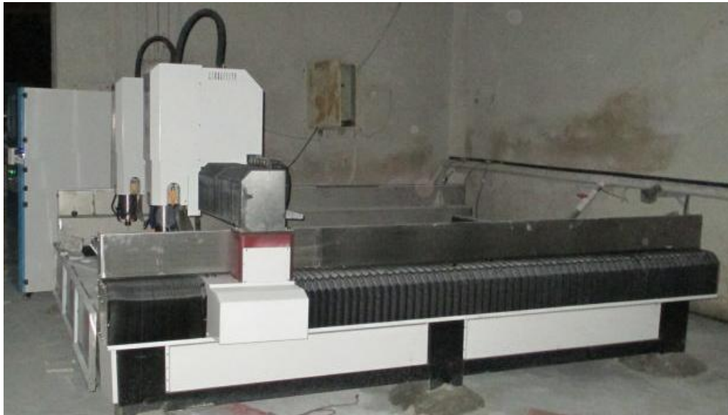
45° Trimming Machine