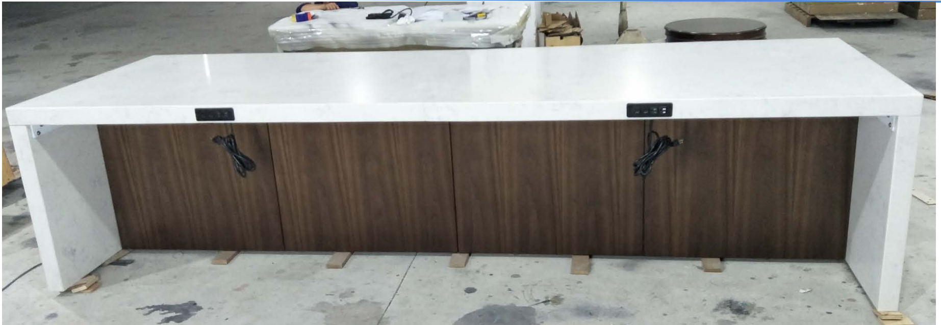
Marriott Omaha Public Space