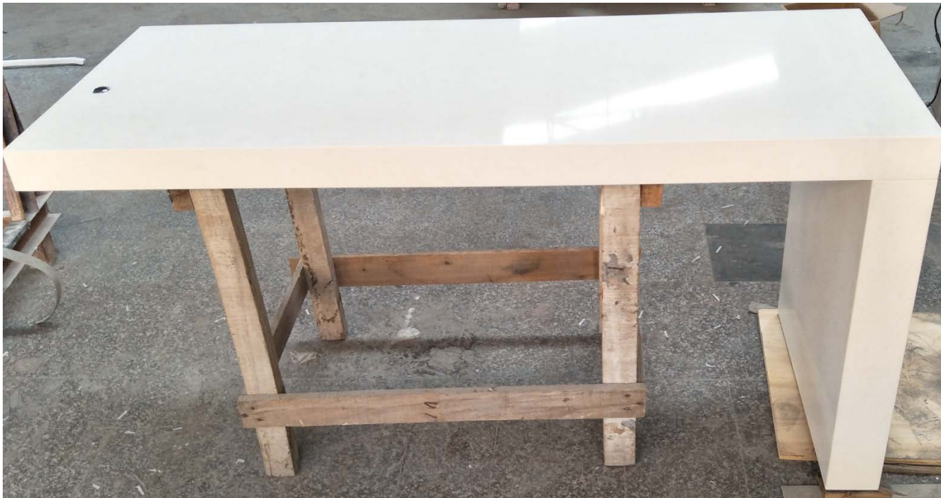
Embassy Suites College Station