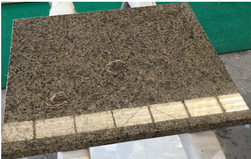
Embassy Suite Dallas