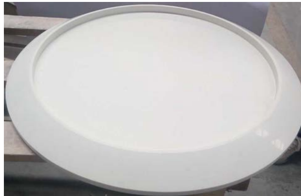
Hyatt Vineyard Creek