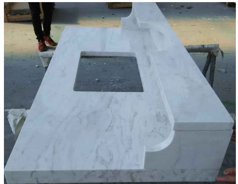
JW Nashville MR